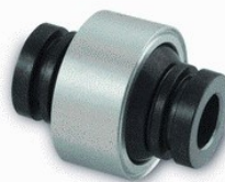
Half the weight - same superior performance