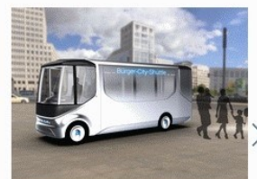
Rethinking microvans and vans

Click here to visit the new website https://www.lightweight-bw.us