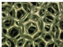
In search of new foams